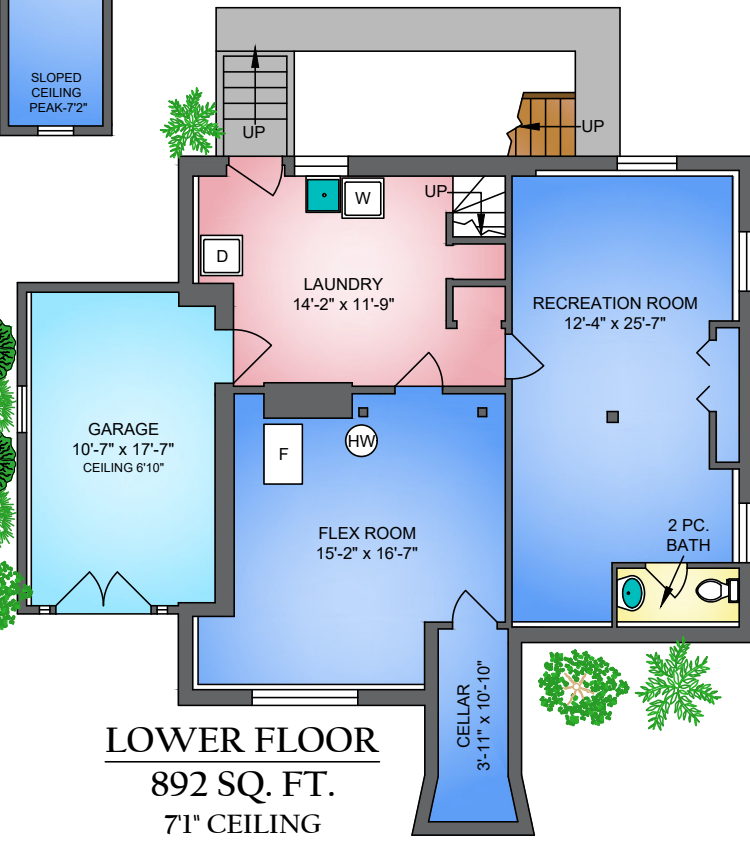
LOWER FLOOR 892 SQ. FT. 7'1" CEILING